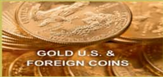
GOLD U.S. & FOREIGN COINS

Monday February 24th - Friday February 28th