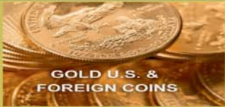
GOLD U.S. & FOREIGN COINS

Monday February 17th - Friday February 21st